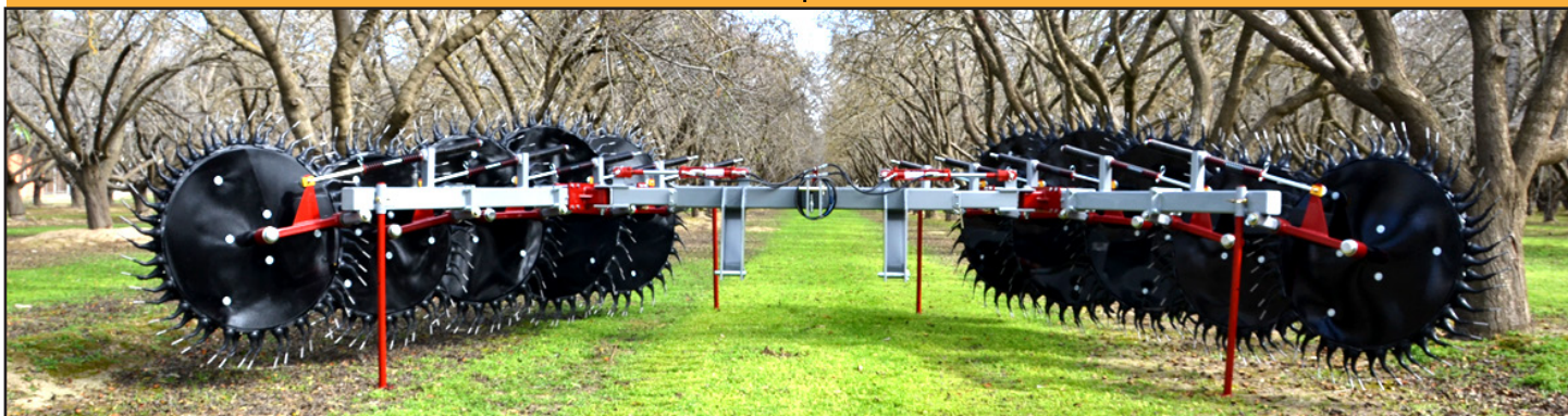
Model # TR610, 10 Wheel

17045 Central Valley Highway Shafter, CA 93263 PHONE (661) 746-4904 FAX: (661) 746-4905